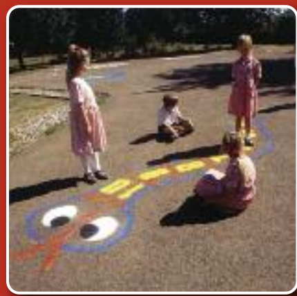
Please contact Ennis Prismo for further information

Non-harmful to the environment and aquatic life